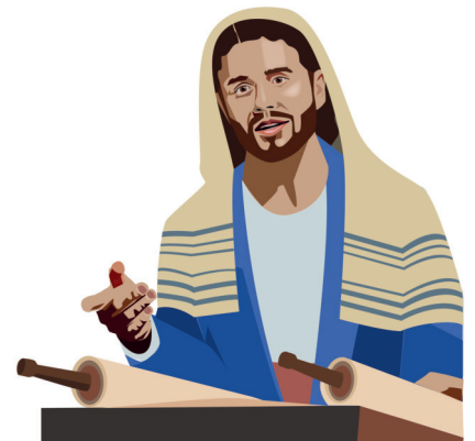
Jesus Teaches at the Synagogue in Nazareth