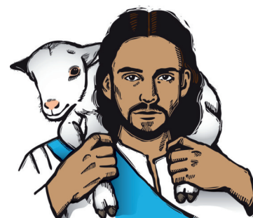
The Parable of the Lost Sheep